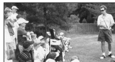
PGA Tour Winner and Golf Commentator Bobby Clampett

The new Lonnie Poole Golf Course at NC State University will serve as the other host facility. Located on the Centennial Campus just off I-40, this stunning layout designed by Arnold Palmer Golf Design is an 18-hole championship course with great views of downtown Raleigh.