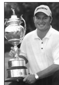
Tim Clark, 10-time tour winner around the world